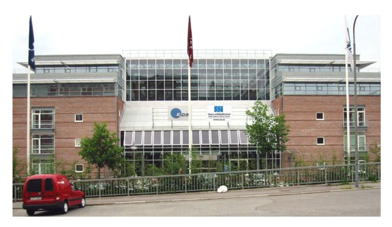
The new SSI office at Solna Strandväg 96 north of Stockholm city. SSI moved in January 2004 from the old office on the premises of the Karolinska University Hospital to this modern and dedicated building with a nice view over Lake Mälaren.

The Swedish Radiation Protection Authority (SSI) is the regulatory and supervisory governmental authority that is responsible for radiation protection on a national level in Sweden. Activities involving radiation are regulated by a special Radiation Protection Act and, as of January 1, 1999, by a new Environmental Code. SSI's terms of reference and budget are decided by the Swedish parliament and the Government on an annual basis. However, like other authorities, SSI makes independent decisions with respect to individual regulatory actions.