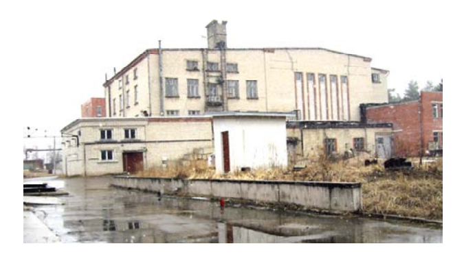
The Salaspils research reactor site. The reactor is now closed but the facilities are used by the Radiation Metrology and Testing Center

One of the cornerstones of modern radiation protection is resources – equipment as well as manpower and know-how – for calibration and intercomparisons of instruments as well as radiation sources. Are we able to measure accurately, in compliance with internationally recognized standards and norms? Are our reference radiation sources well-defined? In order to create traceable and reliable procedures for measuring dose and activity there are international primary standards which can be used for calibrating secondary national or regional standards. These in turn can be used to calibrate local tertiary standards.