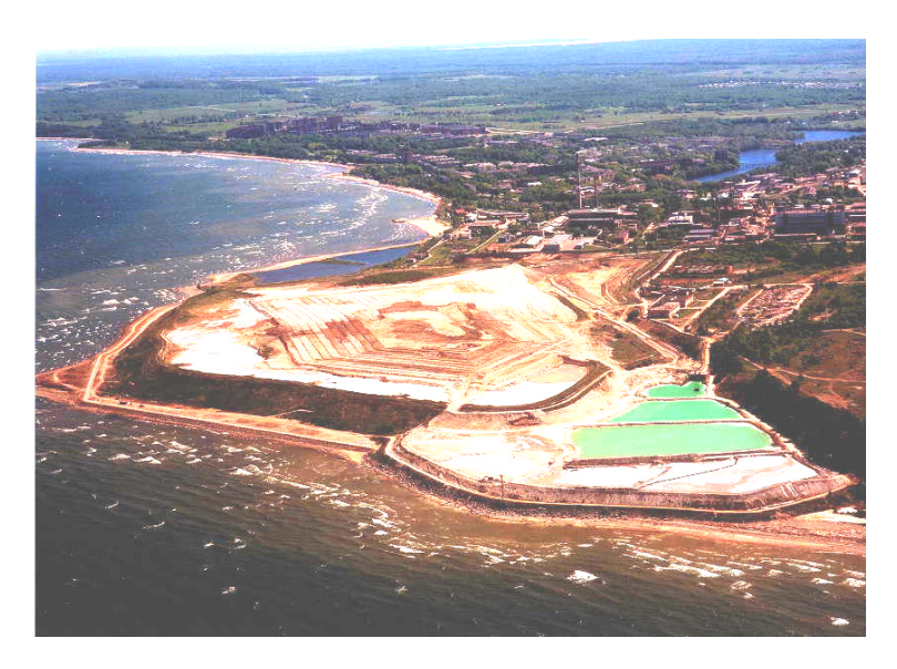
A similar aerial view from 2004 over the Sillamäe site. The shoreline and the dam are reinforced and quite a lage part of the dam is now covered.

As a part of phase 1, initial field studies were made, followed by a risk assessment and additional fieldwork. Several extensive reports were compiled with data on the magnitude of the problem. SSI was the main foreign aid coordinator. Other involved parties were STUK and the Royal Norwegian Ministry of Foreign Affairs. The contractors were Studsvik, NGI and IFE. When quantifying the problem, it was found among other things that the tailings (with a total volume of about 8 million m<sup>3</sup>) contain some 1800 tons of uranium and 800 tons of thorium. There was a leakage to the sea of up to 30