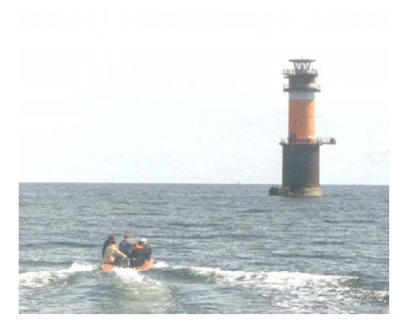
The SIUS team on its way to the Tallinna Madal lighthouse in 1993. Not only a serious risk for shin-wrecking.....

contacted by SSI regarding planning for joint activities in radiation protection. Now, a dozen years later, he was the first speaker at the follow-up seminar to give a talk on his and his country's experiences of the cooperation. He started in a very personal and relaxed manner by outlining the situation in Estonia, such as it unfolded under the unknowing eyes of a people who had till then lacked insight into the situation, since everything of any importance (reactor safety, waste management and environmental issues) had been treated as classified information to Estonians - laymen and experts alike. Also, knowledge in this field was poor. Therefore, in the beginning of the 90's, the newborn nation had to start from scratch. The consequences of the Chernobyl accident had to be