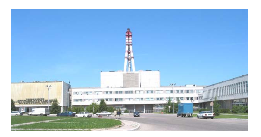
The Ignalina nuclear power plant in Lithuania

upgraded and an additional technical support center created. Accident recovery and rescue activities have taken place. After revision of the EP plan as regards organizational and staff issues in 1998 followed a period of staff training. Later, the plan was revised once again to ensure compliance with the INPP QA program. This was followed by a new period of training.