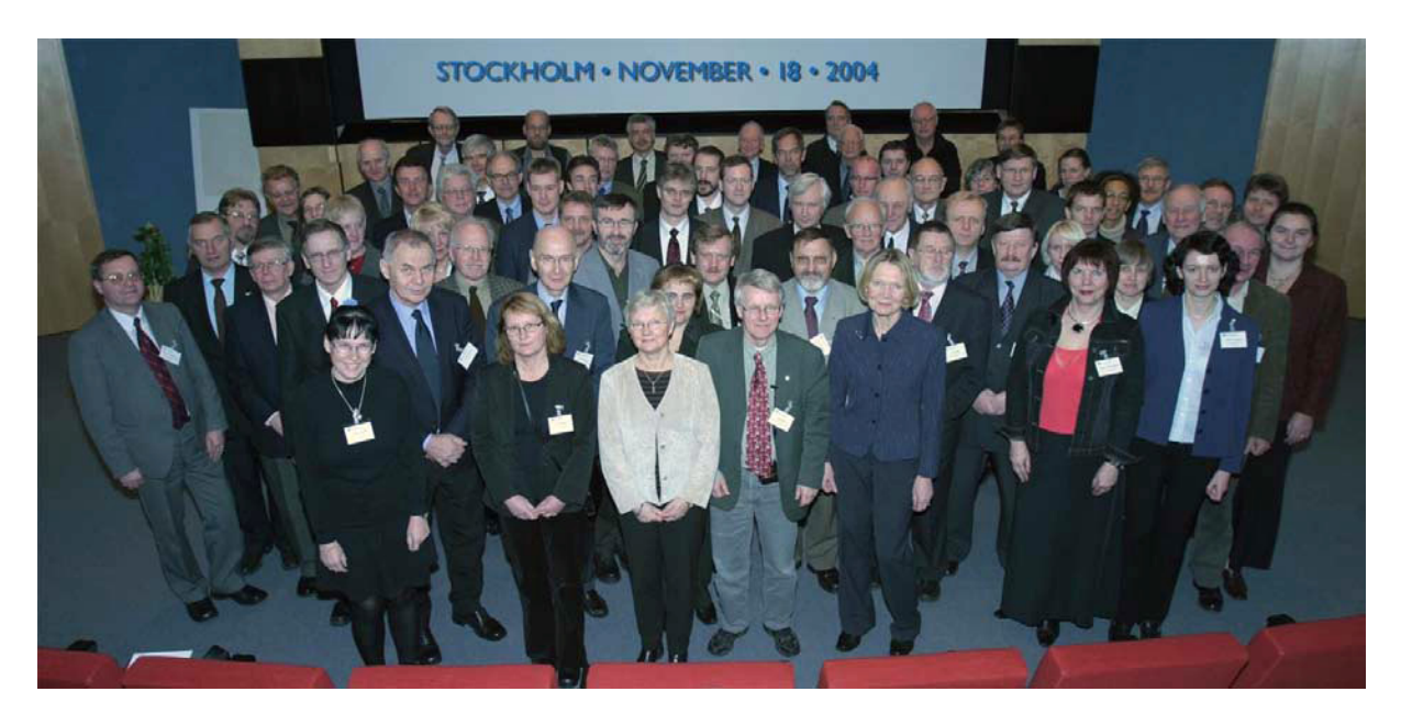
The participants gathered before the podium in the Länsförsäkringar conference hall.

The seminar took place on November 18, 2004, in the conference center of Länsförsäkringar in Solna, Sweden. One of the main objectives was to summarize and conclude the 12 years of Baltic – Swedish cooperation in radiation protection, emergency preparedness and waste management. Another important objective was to discuss the need and possibilities for continued cooperation. For a detailed program, please refer to Annex 1. The seminar gathered some 80 experts from Denmark, Estonia, Finland, IAEA, Latvia, Lithuania and Sweden. A full list of participants is found in Annex 2, whereas Annex 3 gives an explanation of the acronyms used in this report.